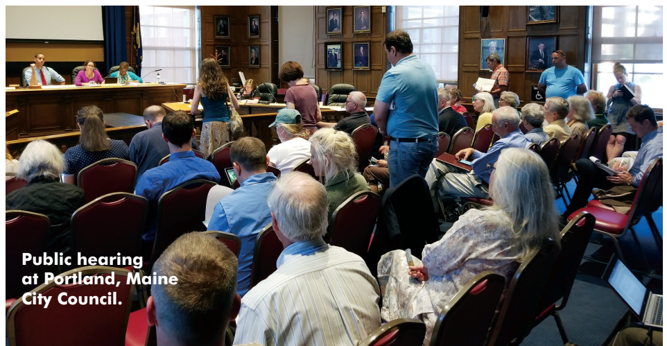
Public hearing at Portland, Maine City Council.

Our regulatory comments are based on our review of the science. Our comments on EPA's use of risk assessment goes to the core of the agency's deficiency in protecting managed and native bees, with specific attention to the inadequacy of mitigation measures for bee-toxic pesticides carried out under state Pollinator Protection Plans. WEIGHING IN WITH STATES. We provided legislative and regulatory comments in the states on a range of policy issues, including a New Hampshire bill to protect children.